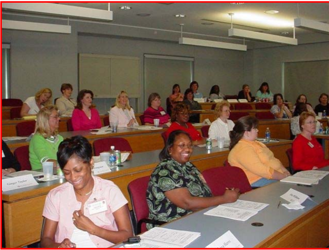
CGAT Class Participants